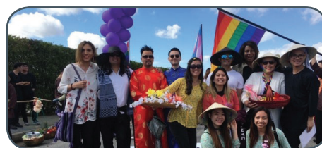
APAIT Tet Festival parade contingent in Westminster, Orange County, 2/9/19.

APAIT ushered in the New Year by participating at the Lunar New Year Pride Festivals held concurrently in Chinatown and downtown Los Angeles called the Golden Dragon parade, and in the streets of Westminster, Orange County for the Tet Festival, on February 9th, 2019.