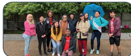
APAIT Tet Festival parade contingent in Westminster, Orange County, 2/9/19.